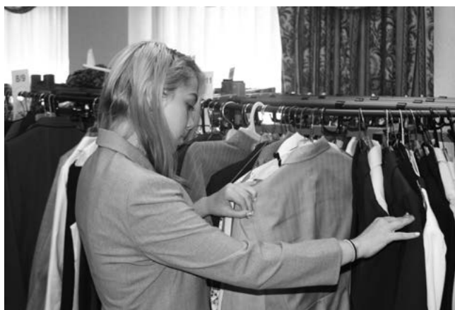
Choosing career-wear at the Connecting the Dots Conference for Foster Care Teens and Young Adults.

Figuring out how to get a job can be confusing. To get help, you can turn to your county's OhioMeansJobs Center. These centers provide free employment services such as help writing a resume, signing up for a job-training program or even help finding a job. Resources vary by county, so be sure to ask your caseworker about your local center and how it can help you.