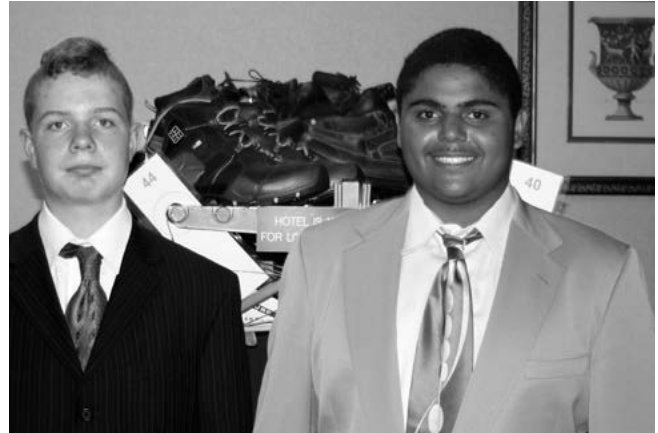
Two youth each receiving a suit through the Suits for Success program.

When you leave a foster placement, your caseworker will schedule an EXIT INTERVIEW with you. This is a time for you to talk to your caseworker about your experience in your foster home. The interview should happen in private within seven days of your leaving a placement. It cannot be done before you leave the placement, and it cannot include your former foster parents. This interview is very important, as it helps the PCSA improve the experiences of other young people who will someday be placed in that home. Be sure to tell your caseworker everything openly and honestly. If this interview doesn't happen, be sure to ask your caseworker about it.