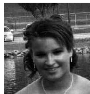
Tricity, Tuscarawas County