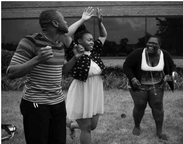
OYAB members enjoy a team-building exercise.

At OYAB, we focus much of our efforts on working with leaders in Congress and private and public agency staff across the state and even the nation. We even hold trainings for agency staff so they can learn how to better interact with youth and empower them for success. We also train youth on how to share their stories. Your story is part of your private life, and if you decide to share it, we want to make sure you have the tools to do so in a way that protects you and gets your message heard.