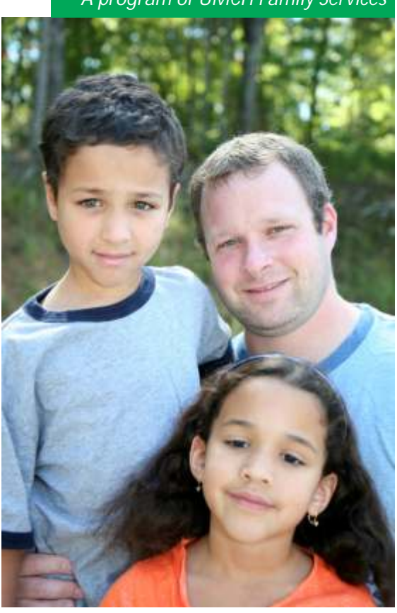
Providing adoptive families the support they need to navigate life's ups and downs